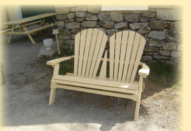
Double Adirondack Chair

Folding Adirondack Chair Adirondack Recliner Convertible Footstool/Table