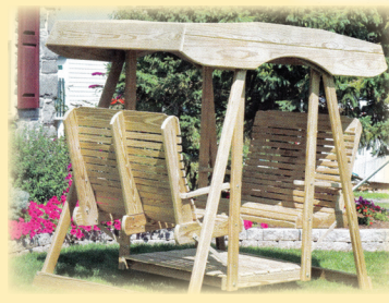
Double Rollback Swing Cordura Nylon Cover Sold Separately